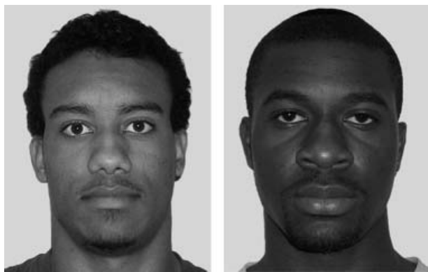
Fig. 1. Examples of variation in stereotypicality of Black faces. These images are the faces of people with no criminal history and are shown here for illustrative purposes only. The face on the right would be considered more stereotypically Black than the face on the left.

phia, Pennsylvania, that advanced to penalty phase between 1979 and 1999. Forty-four of these cases involved Black male defendants who were convicted of murdering White victims. We obtained the photographs of these Black defendants and presented all 44 of them (in a slide-show format) to naive raters who did not know that the photographs depicted convicted murderers. Raters were asked to rate the stereotypicality of each Black defendant's appearance and were told they could use any number of features (e.g., lips, nose, hair texture, skin tone) to arrive at their judgments (Fig. 1).