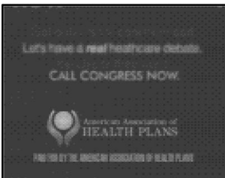
Let's have a real healthcare debate. Call Congress now. [PFB American Association of Health Plans]