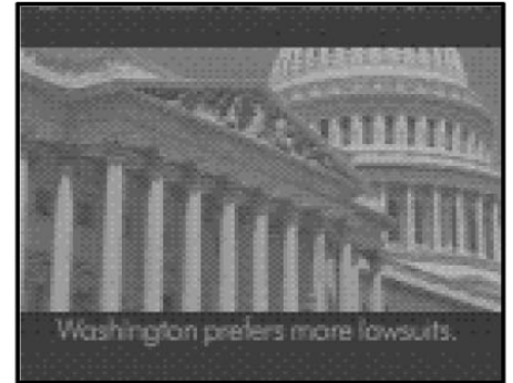
Washington prefers more lawsuits.