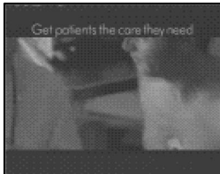
Get patients the care they need.