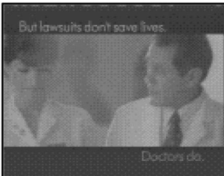
But lawsuits don't save lives. Doctors do.