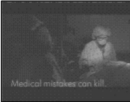
[Caption]: Medical mistakes can kill.