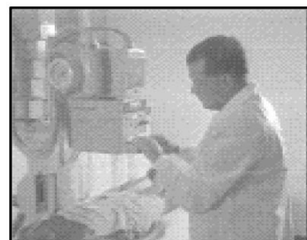
and holds HMOs accountable when they wrongfully deny treatment. Call