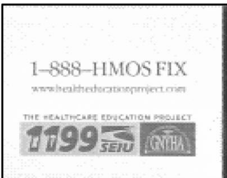
1-888-HMOS-FIX for real HMO reform now.