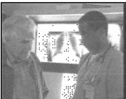
say about treatment options. Real HMO reform that protects