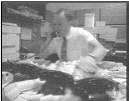
[Announcer]: Tired of HMO bureaucrats controlling medical decisions and