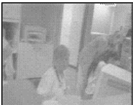
patients, nurses, doctors, and hospitals from HMO abuses