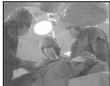
that doctors, not big for-profit insurance companies, have the final