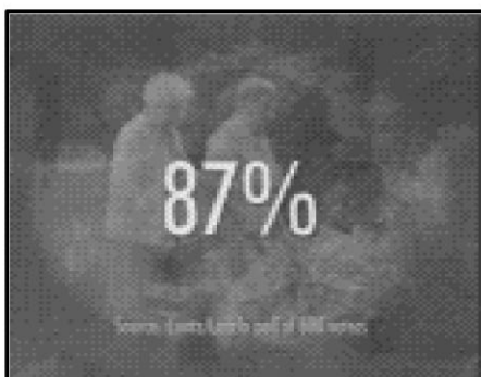
[Announcer]: 87% of voters say it's time for Congress to pass a real patients' bill of rights.