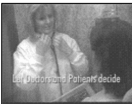
Senator's to stand up for patients and let America's doctors make your healthcare