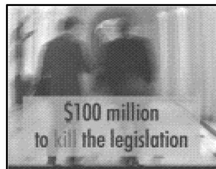
While Senator's narrowly pass a bill that supports not you and your