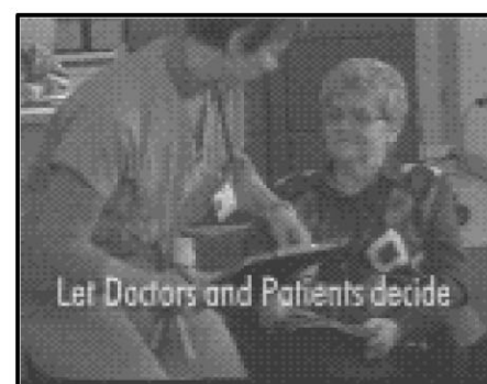
decisions, not HMO bureaucrats. The time is now