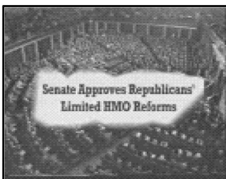
family but the Big HMO's. That's wrong. Tell your