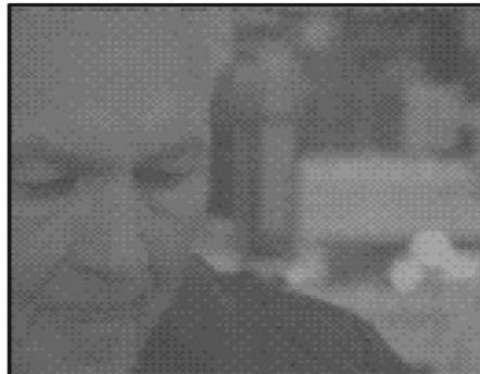
down in Washington decided to cut too much money from the Medicare HMO's