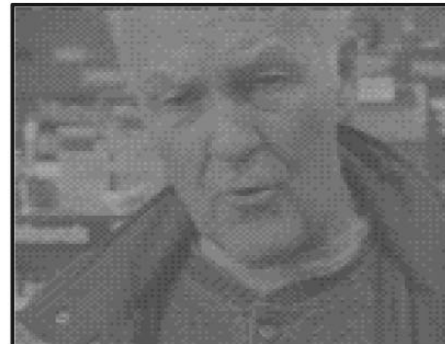
and seniors like me end up paying more and getting less, even