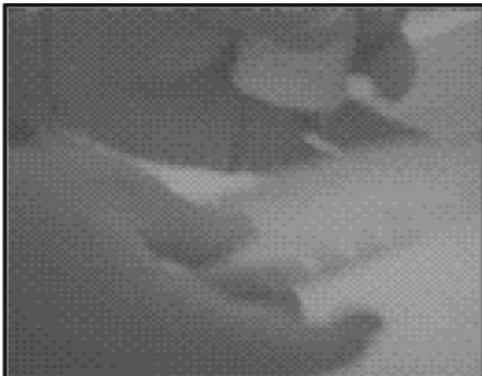
[Man1]: " I chose a Medicare HMO because it cost less, gave me greater coverage and I got lmy prescriptions paid for. But then politicians