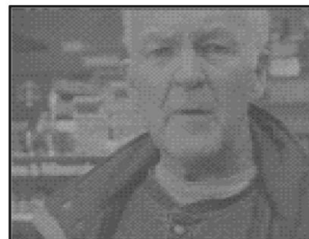
HMO's like mine, you can bet I'll have an answer for them.