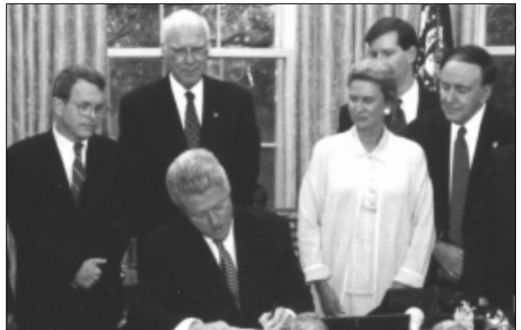
NAZI WAR CRIME ACT SIGNED Rep. Maloney at the signing of the Nazi War Crimes Disclosure Act (HR 4007), which she authored. Also watching President Clinton sign the law were (left to right) Sen. Mike DeWine (Ohio), Sen. Patrick Leahy, and Rep. Steve Horn (California).

Maloney had joined with over 200 colleagues in signing a discharge petition to force this year’s Shays-Meehan bill out of committee and be voted on by the full House.