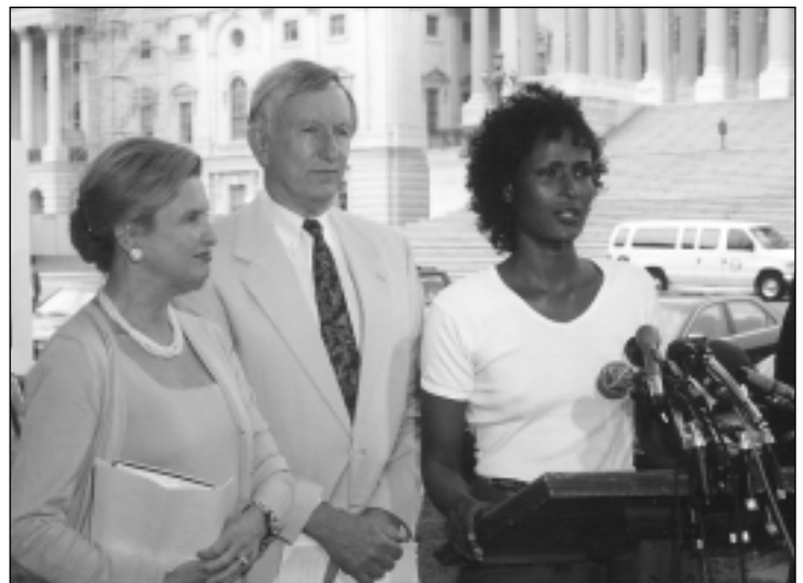
Rep. Maloney with Sen. Jim Jeffords (R-Vermont) and Waris Dirie as they express support for UNFPA funding on Capitol Hill.