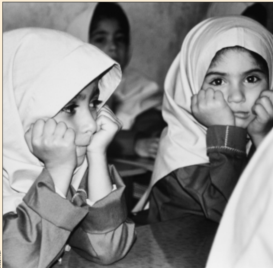
Schoolgirls in class in Iran.

For many teachers, the child-friendly approach can be a radical departure from traditional teaching methods. Nevertheless, there is a broad awareness that such change is needed to engage children as partners in their education and keep them coming to school.