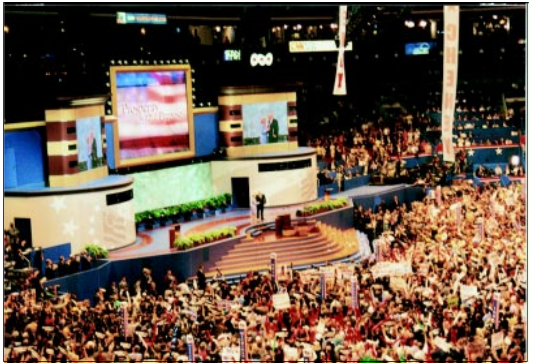
George W. Bush's vice presidential choice Dick Cheney, pictured with his wife, Lynn, receives a warm response from Republican convention attendees.