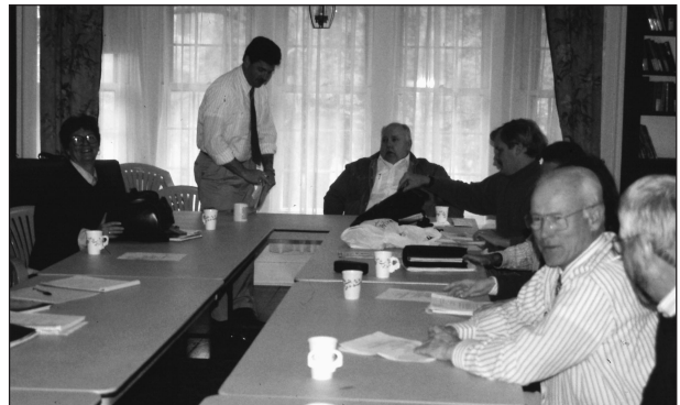
New Jersey Program Review

My discussion with some of New Jersey's land conservancy community disproved the idea that people are the same everywhere. Pressures and influences cause regions of the country to be distinct. The Forest Legacy Program was conceived on ideas formulated where forestland is still abundant and available as a resource, yet set up to be flexible to accommodate regional differences. The perfect land protection program for New Jersey is different than the perfect land protection program for New England.