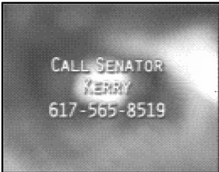
probation until this label stands for fairness. [DIS]: Paid for by the AFL-CIO.