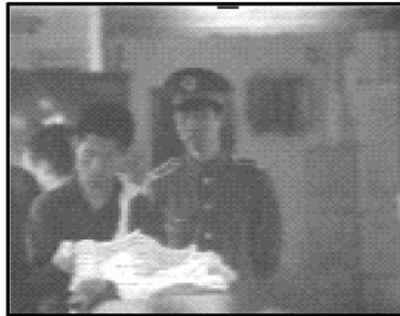
annual review of China's record and reward China with a permanent trade