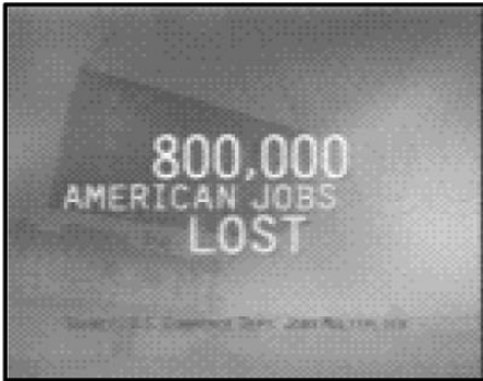
draining American jobs. Now Congress is set to scrap its