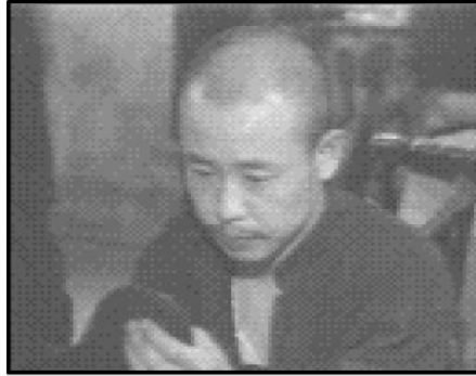
forced labor camps, of wages as low as 13 cents an hour,