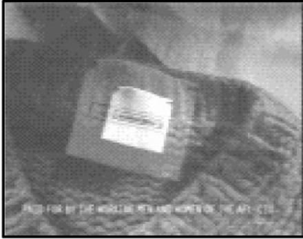
[Announcer]: Behind this label is a shameful story of political prisoners and