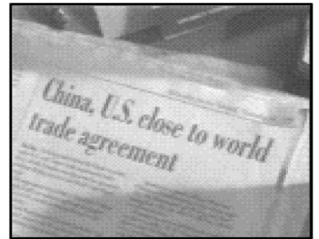
deal. Tell Senator Kerry to vote "No" and keep China on