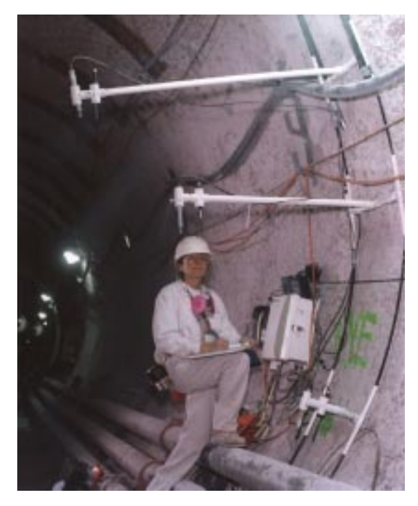
A Nye County scientist installs instrumentation in the ESF. This instrumentation allows scientists to monitor humidity, temperature, and airflow and to obtain data on how tunneling within the mountain affects moisture migration in the potential repository area.

in these boreholes to help scientists monitor hydrologic conditions in the rock. Inside the underground laboratory called the Exploratory Studies Facility (ESF), the Nye County team set up sampling stations for monitoring humidity, temperature, and airflow. They did this to obtain data on how tunneling within the mountain affects the movement of moisture in the potential repository area.