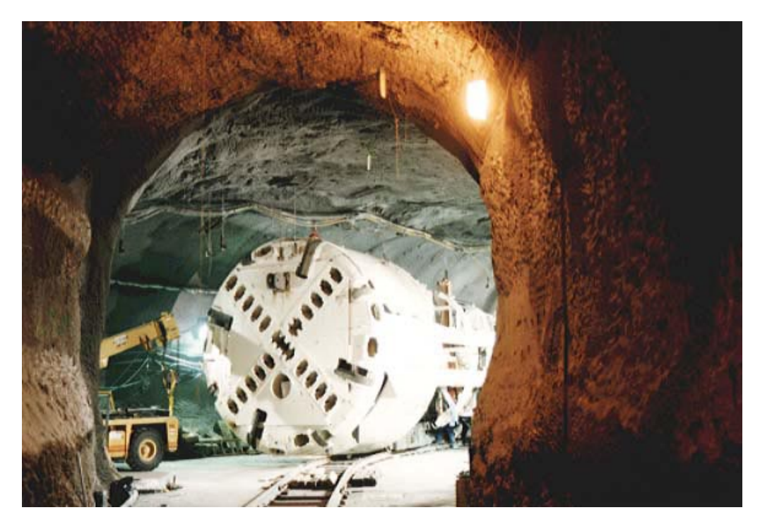
This tunnel boring machine was used to excavate the cross drift. Workers assembled the machine underground and pushed it forward on rails to begin excavating the tunnel, which extends 2.8 kilometers (1.7 miles). The excavation started in December 1997 and ended in October 1998.

The cross-drift traverses a section of rock that would be occupied by the potential repository. Scientists have finished mapping the geologic features exposed along the tunnel's rock face. Thermal and hydrological tests designed to confirm the results of similar tests in the ESF are also planned. ■