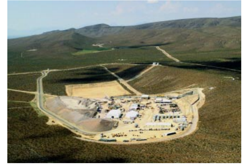
The Viability Assessment concluded that scientific and technical work at Yucca Mountain should proceed. Yucca Mountain is located about 100 miles northwest of Las Vegas, Nevada.

Over the past 15 years, OCRWM has been studying a site at Yucca Mountain, Nevada, to determine whether it is a suitable place to build a geologic repository for the Nation's spent nuclear fuel and high-level radioactive waste.