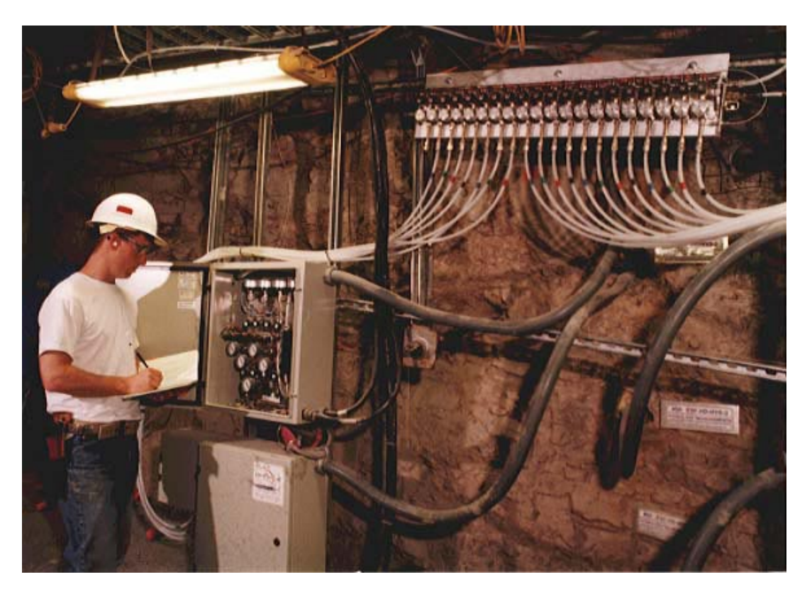
A technician inspects equipment used to inject a mixture of compressed air and a tracer gas (SF-6, sulfur hexaflouride) into a borehole in the cross-drift. After some time, scientists will recover the gases from a separate borehole. By knowing the distance between the boreholes and the travel time for the gas, they can determine how fast fluids and gases move through the rock.