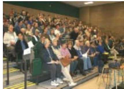
The beetle meeting in Coeur d'Alene, ID drew more than 300 interested citizens

IDL sponsored four public meetings in partnership with the University of Idaho Cooperative