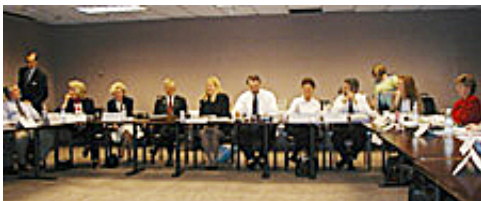
FTRAC attendees at its recent meeting held in Washington, D.C.

The Committee also discussed several issues during the course of the meeting--biotechnology, shelf-stable bakery products, newly introduced obesity legislation (IMPACT bill) and planning of the 2003 ABA-USDA Agricultural Research Service Annual meeting on wheat, flour and end product quality issues. The Committee also agreed that it would like to meet with the Centers for Disease Control (CDC) to learn more about its food safety research activities.