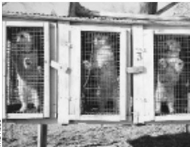
Inhumane puppy mill conditions were not addressed in the final farm bill.

Puppy Mills: The Senate adopted by unanimous voice vote an amendment offered by Sens. Rick Santorum (R-PA) and Richard Durbin (D-IL) calling for socialization of puppies at commercial dog breeding operations, modest limits on excessive overbreeding (prohibiting females from being bred every single heat or before one year of age), and a “three strikes” policy to revoke the licenses of those