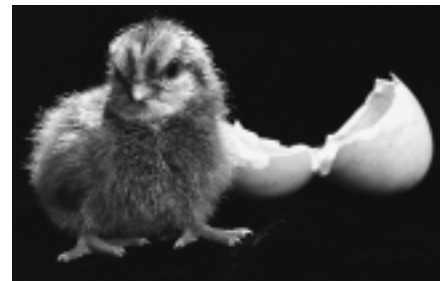
Commercial airlines will carry baby chicks as “regular” mail.

Baby Chicks: The conferees included an amendment adopted in the Senate by voice vote requiring commercial airlines to carry baby chicks as ordinary mail, rather than as live animals needing modest protection from crushing, freezing, overheating, and other dangers. This means that hatcheries can avoid paying a few more dollars per crate, each holding an average of 120 newborn chicks. Sens. Charles Grassley (R-IA), Tom Harkin (D-IA), and Russell Feingold (D-WI) originally introduced the legislation.