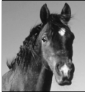
Horsemeat for human consumption should be a thing of the past.

Horsemeat: H.R. 3781, introduced by Rep. Connie Morella (R-MD), to prohibit the slaughter, import, export, trade, and transport of horses for human consumption. Rep. Thomas Reynolds (R-NY) introduced a less far-reaching bill, H.R. 2622, which does not prohibit the export of horses for human consumption, although the market for U.S.-produced horsemeat is primarily foreign.