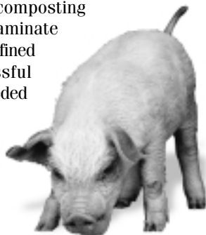
Funding to promote hoop barns was approved.

Hoop Barns: Congress provided $200,000—championed by Sen. Tom Harkin (D-IA)—in the Agriculture Appropriations Act, P.L. 107-76, to promote “hoop barns” as an alternative to inhumane confinement systems. Hoop barns are inexpensive, easy-to-install, open-ended structures allowing farm animals freedom of movement and access to pasture. They are better for the environment, using solid manure composting rather than lagoons that can contaminate groundwater. And animals are not confined in overcrowded, unsanitary, stressful conditions, so antibiotics are not needed to promote growth and prevent disease. Iowa’s Leopold Center for Sustainable Agriculture will use