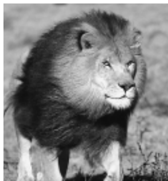
Unsporting, inhumane canned hunting must be stopped.

Canned Hunts: S. 1655/H.R. 3464, introduced by Sen. Joseph Biden (D-DE) and Rep. Sam Farr (D-CA), to prohibit interstate or foreign commerce of captive exotic animals to be shot for entertainment or trophies. Canned hunt operations hold animals such as African lions, giraffes, and antelopes within fenced enclosures, offering their “clients” a guaranteed kill—often under a “no kill, no pay” arrangement. These cruel and unsporting operations also pose a threat to native wildlife; the confined exotic animals are grouped in unusually high densities and can contract diseases more readily than