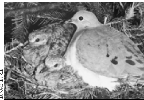
LEONARD LEE RUE III

Nontherapeutic antibiotic use in factory farms hurts animals and people.