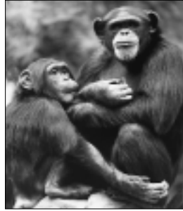
Research chimpanzee sanctuaries got federal funding.

Chimpanzee Sanctuaries: The Labor-HHS Appropriations Act, P.L. 107-116, contained $5 million to begin building the national chimpanzee sanctuary system authorized in the last Congress by P.L. 106-551. The funds, sought by Sens. Mary Landrieu (D-LA) and Richard Durbin (D-IL), will help ensure that construction moves forward so chimpanzees formerly used in biomedical research have a chance to live out the remainder of their lives in a natural setting, rather than in small, barren cages at federally funded laboratories.