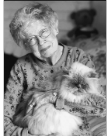
A uniform charitable trust system would protect pets.

What else can you do? Share this scorecard. You can access it at www.hsus.org and www.fund.org or call The Fund for additional copies at 301-585-2591. Write a letter to the editor of your local paper(s) to call attention to these issues. We also invite you to join the Humane Activist Network, a joint project of The HSUS and The Fund for Animals, and subscribe to HUMANELines , a weekly e-mail newsletter that provides you with breaking news on urgent legislative issues that need your help. Remember, your active involvement can and does make the difference for animals. ■