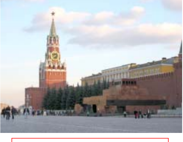
Lenin's Tomb with the famous Kremlin Clock Tower in the background.

one side is Lenin's Tomb. During the Soviet days leaders would stand on the building watching troops and military equipment parade by. Behind the tomb is the Kremlin. Opulent. As someone said, "If you ever wanted an excuse for a revolution just walk through the Kremlin." At the other end of the Red Square is St. Basil Cathedral. It is beautiful. The communists turned it into a museum and only recently has it been reopened as a church. Across from Lenin's tomb is the largest department store in Russia, with clear capitalistic merchandising (i.e. Christian Dior). Yes, Russia today