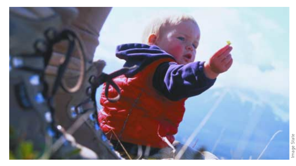
Children are instinctively drawn to nature. It's up to adults to nurture this curiosity.