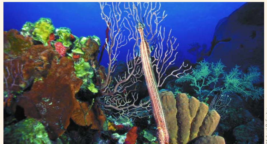
With 3,000 miles of coastline and 4,200 islets and keys, Cuba is home to some of the world's least-disturbed coral reefs.