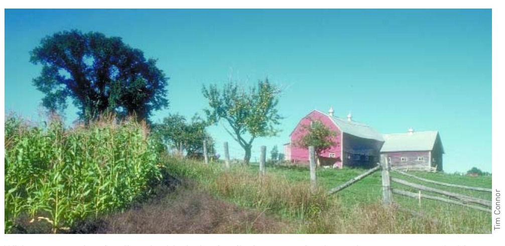
With conservation funding doubled, the family farmer gains incentives to preserve habitat.

"There is new recognition that conservation is a way to boost income for family farmers," says Faber. "Our goal now is to make sure the conservation dollars yield maximum environmental benefits on the ground."