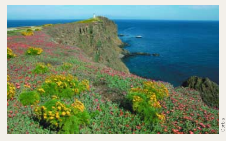
Often called "America's Galapagos," the Channel Islands are home to a strikingly rich diversity of marine life.

Such declines convinced some commercial fishermen to put aside their differences and work with Environmental Defense to establish marine reserves around the Channel Islands. Recently, the state held a public hearing on a proposal to ban fishing in 25% of the Channel Islands National