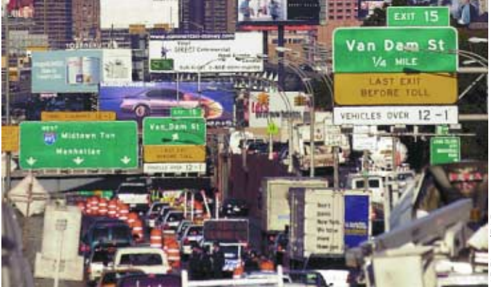
It doesn't have to be like this: The daily crush at the Queens-Midtown tunnel.