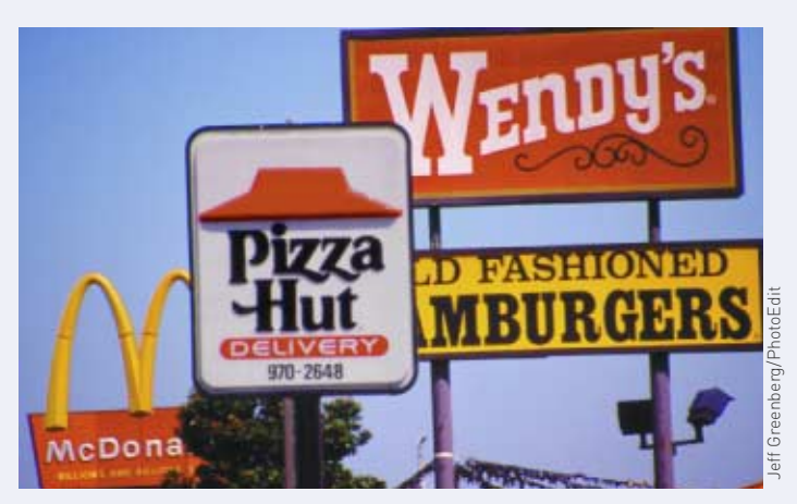
Saying no to antibiotics. McDonald's and Wendy's have aligned with efforts to halt the use of Cipro in poultry.

Our newly launched interactive web tool, Seafood Selector, is a unique one-stop source for consumers concerned about the environment and their health. It can be accessed at