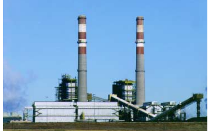
Our efforts could soon cut pollution at the Comanche power plant.