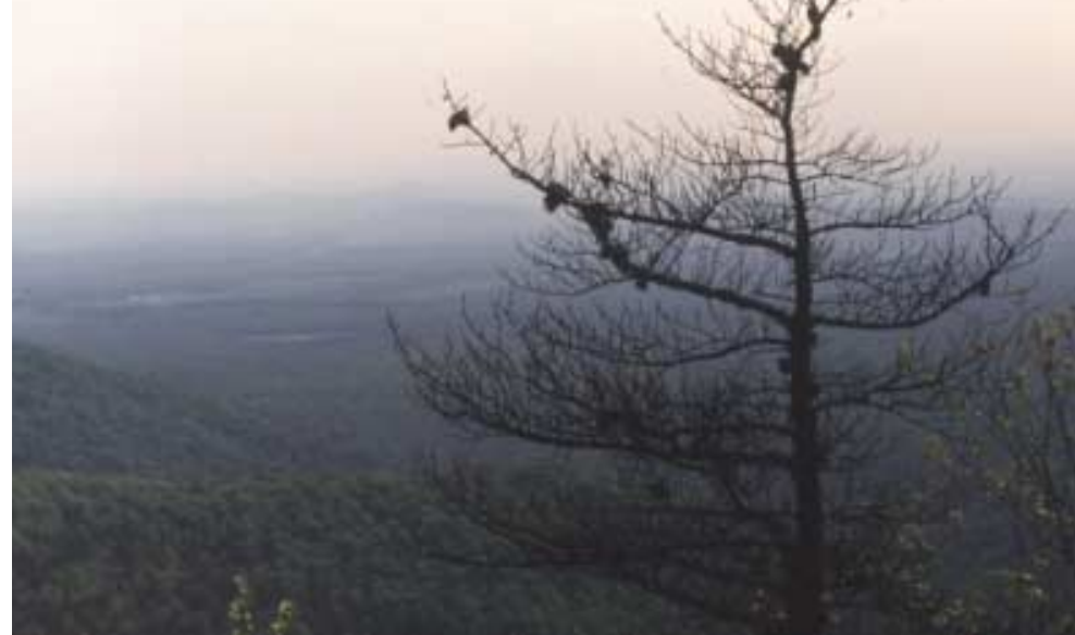
Chronic haze plagues Shenandoah National Park. Don't blame us, the utilities say.