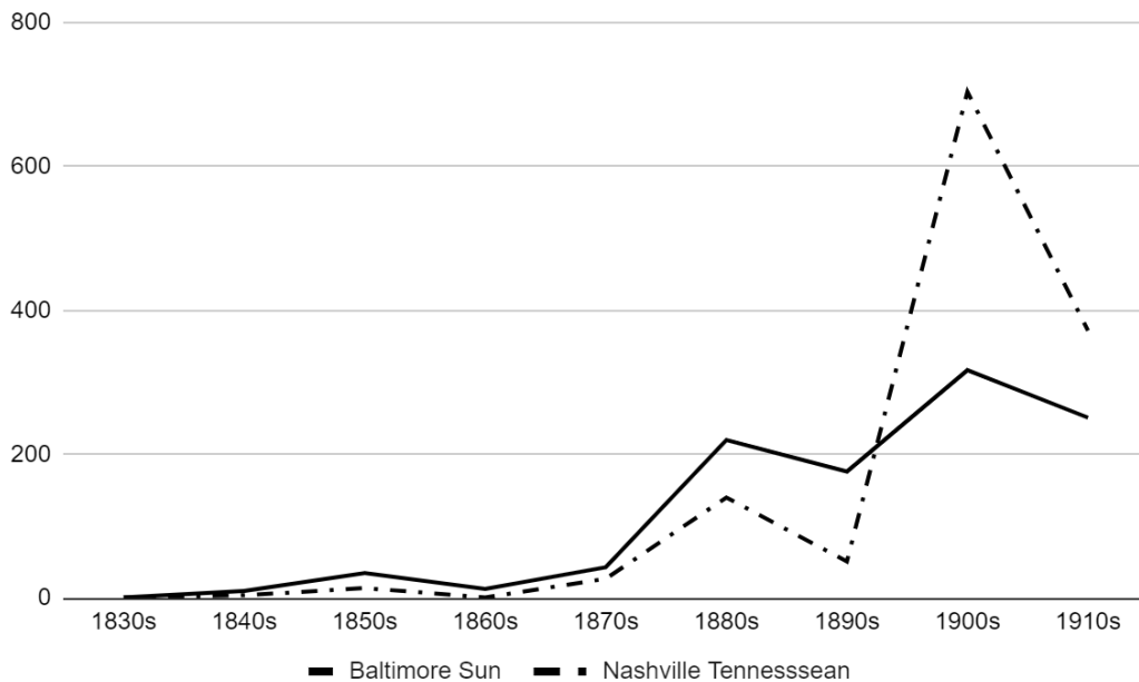
Figure 1. Overall Newspaper Coverage of the Temperance Movement from 1830 to 1919.

The Nashville Tennessean publications about Temperance are displayed by the dotted line while Temperance publications in the Baltimore Sun are displayed by the solid black line. Both newspapers show significant upward trends in Temperance related articles by decade which peaked at the beginning of the 21st century. In total, we identified 1,314 articles relating to the Temperance movement in the Nashville Tennessean and 1,066 articles in the Baltimore Sun. The noticeable spike in the Nashville Tennessean coverage in the 1900s can best be explained by a change in the newspaper's ownership to Luke Lea, a political activist and known prohibitionist. Lea made Edward Ward Carmack, another prominent prohibitionist, the editor of the paper. Carmack then used his position to express his own views and attack anti-prohibition candidates for office (Dickinson, 2018).